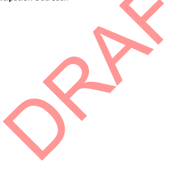
Table 4 – Citizen Participation Outreach